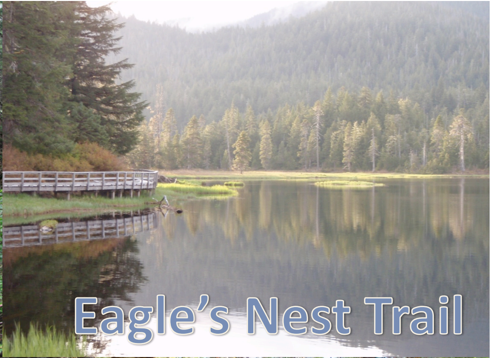
Eagle's Nest Trail