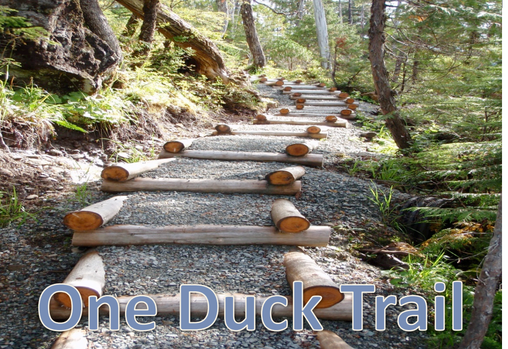
One Duck Trail