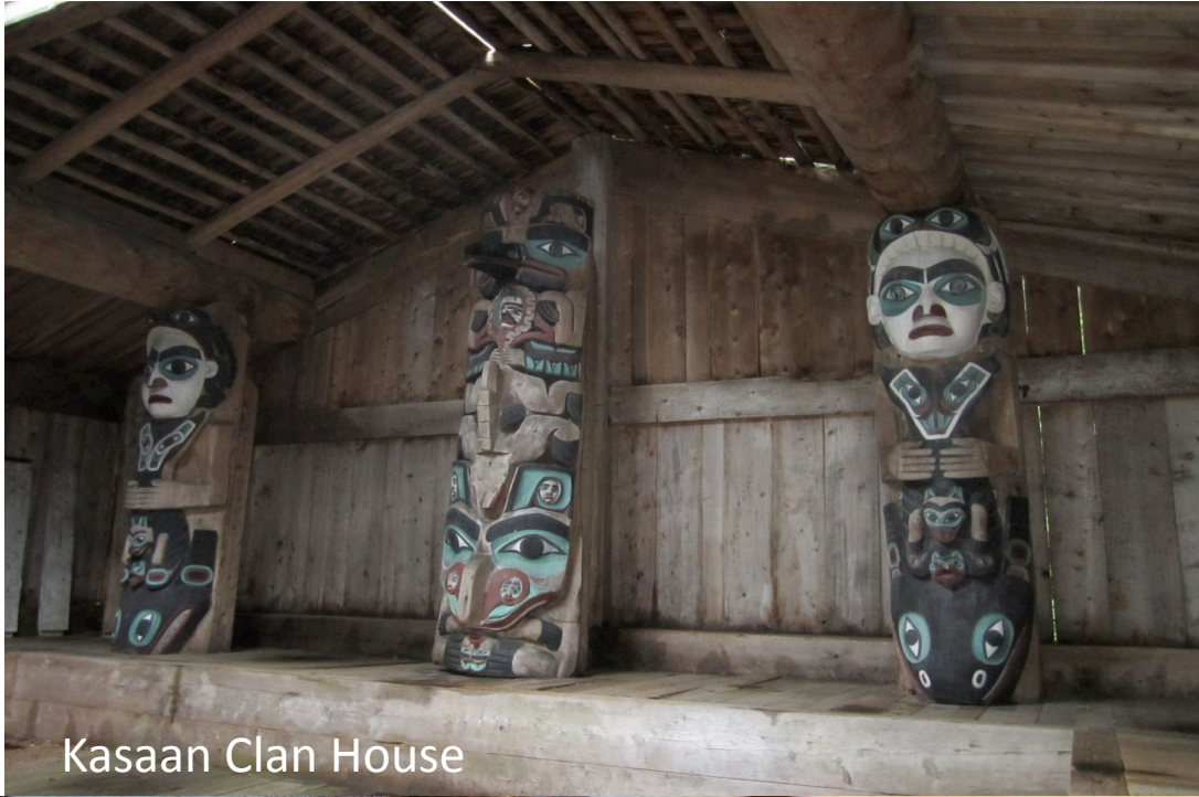
Kasaan Clan House

Four Federally-recognized Tribes Craig Tribal Association Hydaburg Cooperative Association Klawock Cooperative Association Organized Village of Kasaan