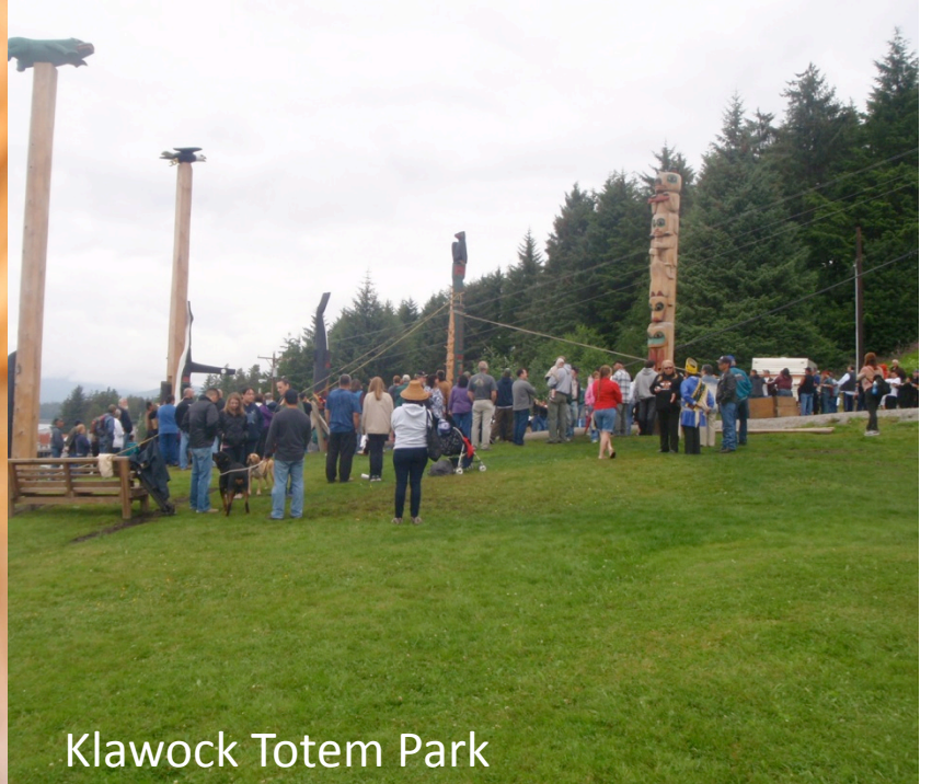
Klawock Totem Park