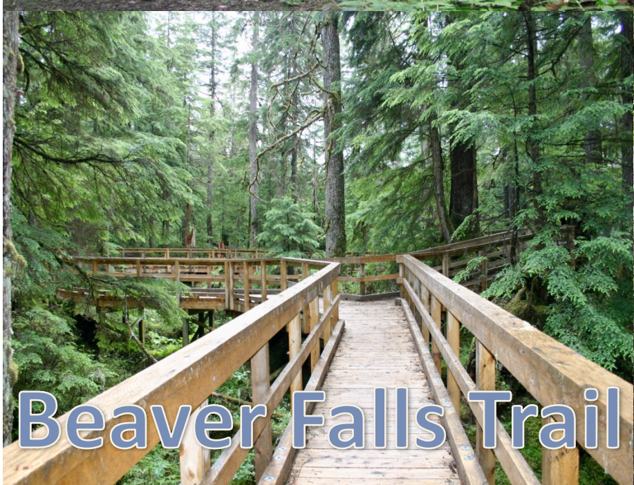
Beaver Falls Trail