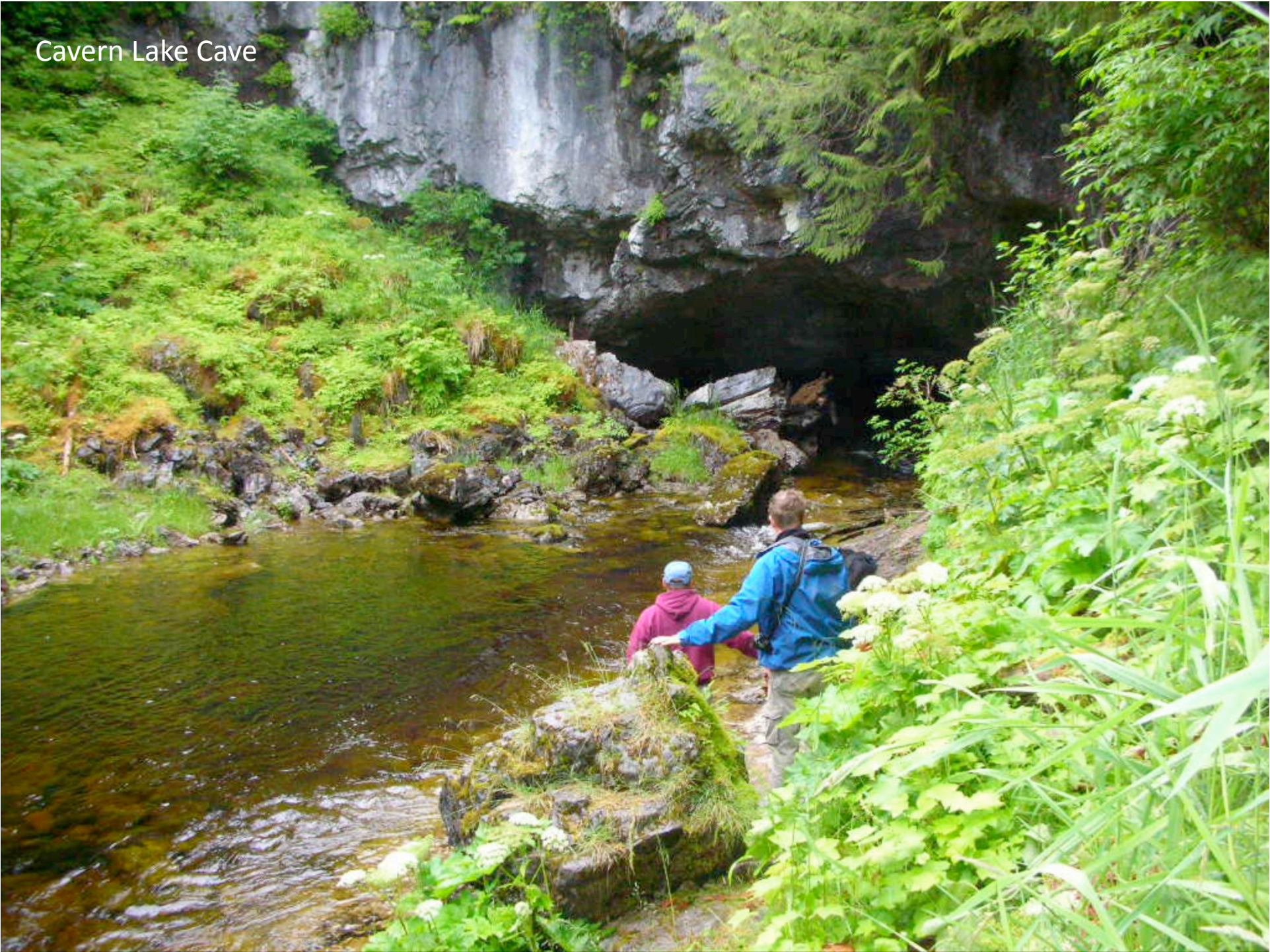
Cavern Lake Cave